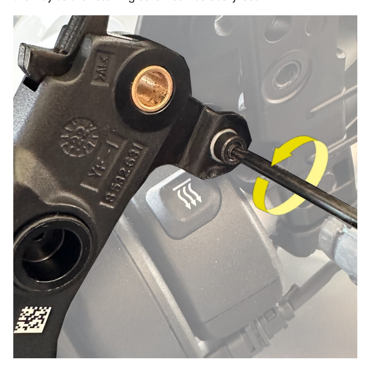
3d) On the inside of the lever, use a 2mm hex key on the push rod screw and turn CLOCKWISE until the lever is released.

3c) On the underside of the lever, use the 2mm hex key wrench to slightly loosen the retaining screw on the push rod barrel. Do not loosen all the way as the retaining screw can be easily lost.